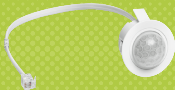
0489 53 / 0489 54